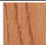
LIGHT OAK LO

Note: Printed samples shown may differ slightly from actual colors. Please contact your Datum representative for actual color samples if required.