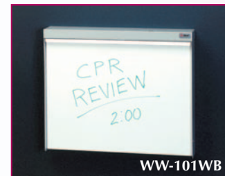
Painted White Board Finish