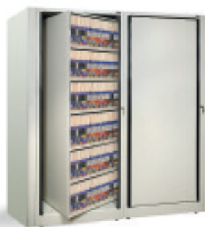
Ez2™ Rotary Action File