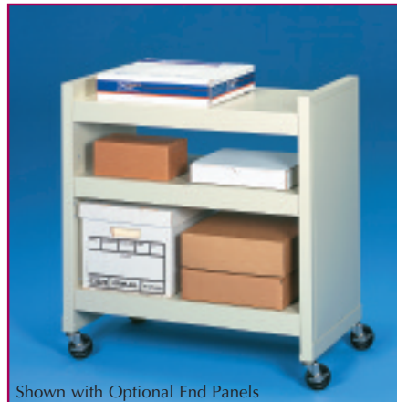
Shown with Optional End Panels