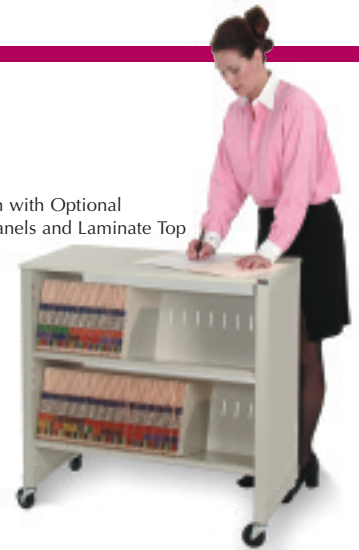
Shown with Optional End Panels and Laminate Top